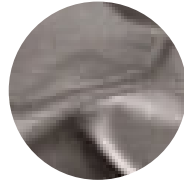
Stormy Silver Matte