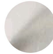
Cream Silver Matte