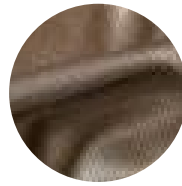
Blue Moon Rose Gold