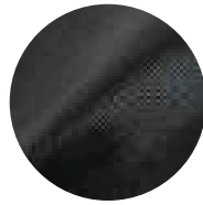
Black Black Pearl