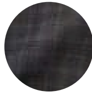
Adriatic Brown Dust Matte