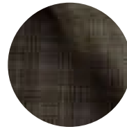
Stormy Brown Dust Matte