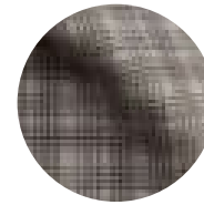
Super White Brown Dust Matte