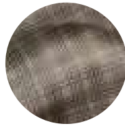
Cream Brown Dust Matte