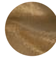
Natural Copper Bronze