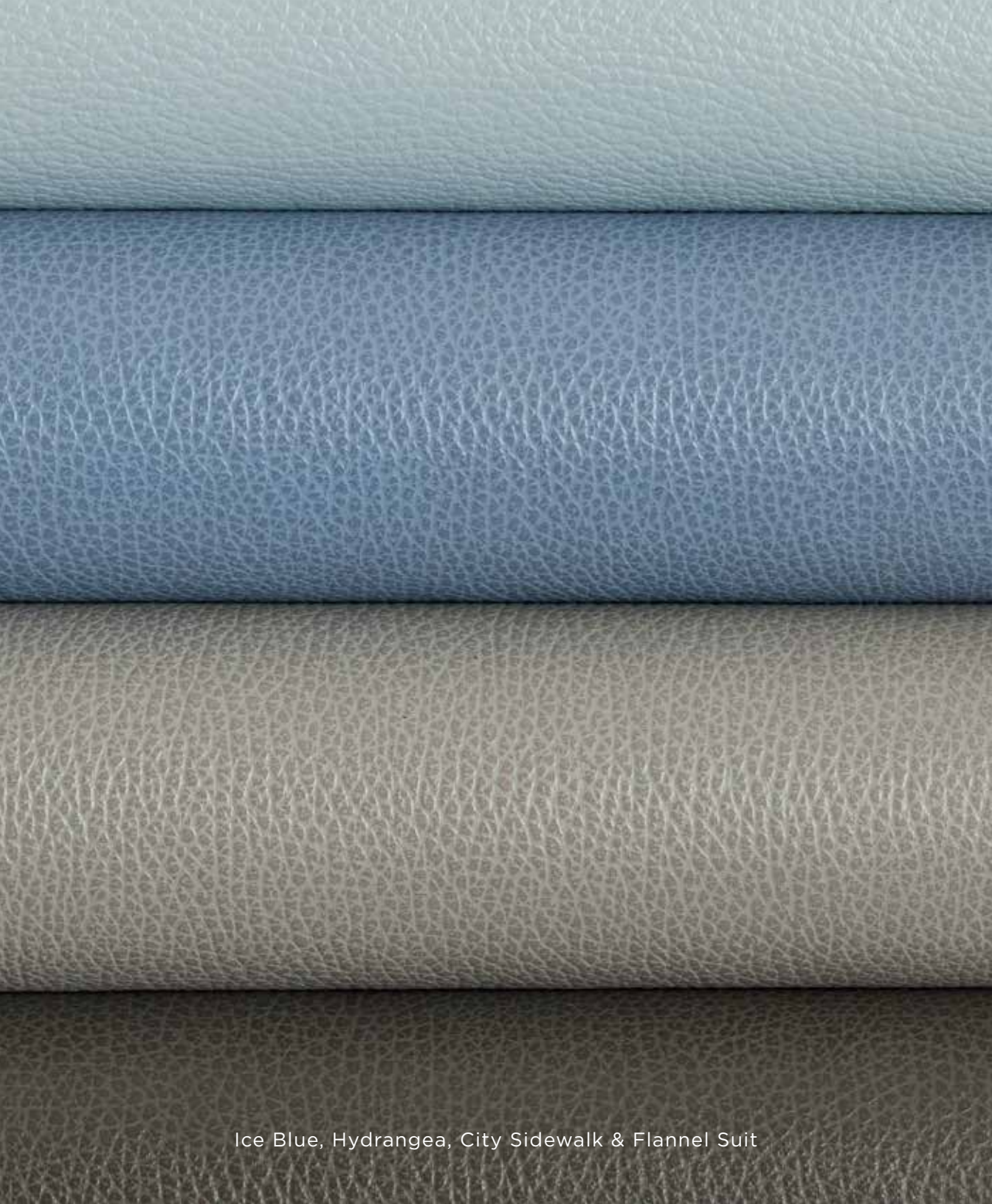
Ice Blue, Hydrangea, City Sidewalk & Flannel Suit