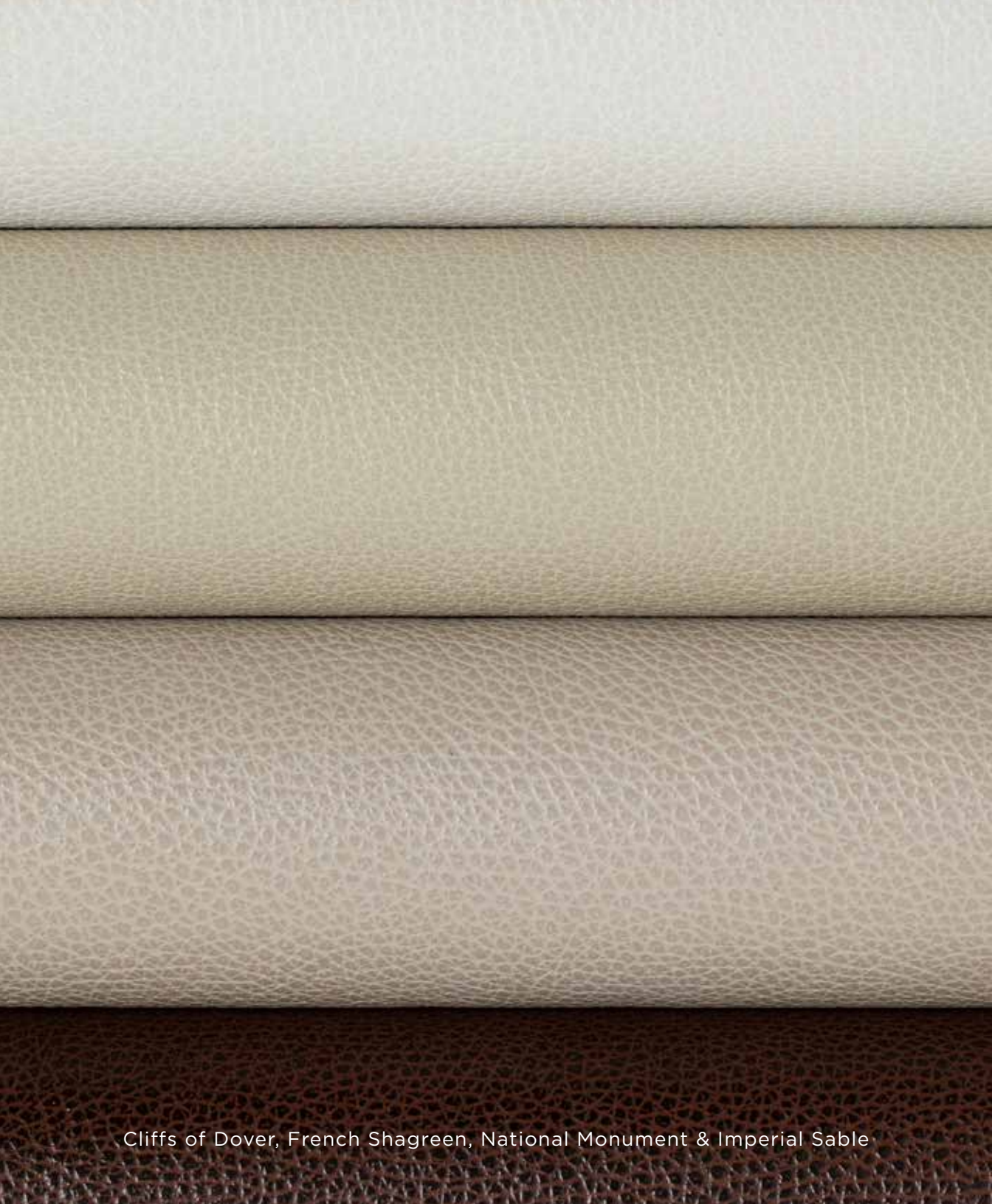
Cliffs of Dover, French Shagreen, National Monument & Imperial Sable