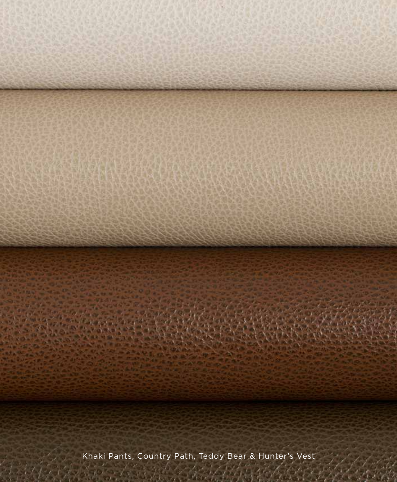
Khaki Pants, Country Path, Teddy Bear & Hunter's Vest