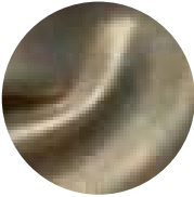
Slate Grey 24K Gold