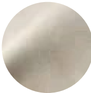
Ivory 24K Gold