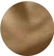
Camel Gold Patina