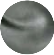
Slate Grey Enchanted Silver