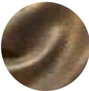
Granite 24K Gold