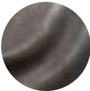
Granite Enchanted Silver