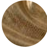
Taupe Copper Bronze