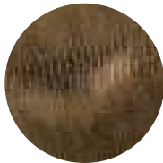
Buttercup Multi Bronze