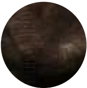
Black Multi Bronze