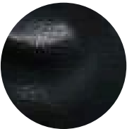
Blue Moon Glaze