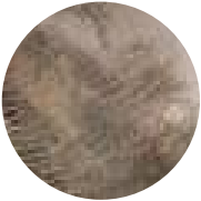
Cream Multi Pewter