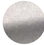
Stormy Hammered Silver