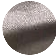
Smoke Taupe Pearl