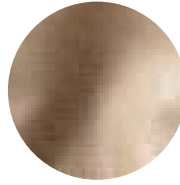
Taupe Taupe Pearl