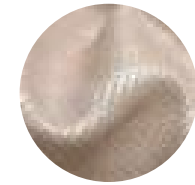
Stormy Taupe Pearl