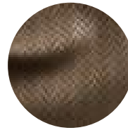
Smoke Taupe Pearl