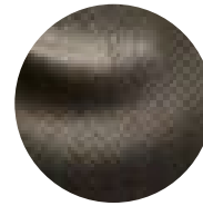
Stormy Copper Pearl