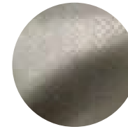
Stormy Radiant Silver