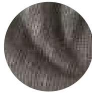
Satin Suede Smoke