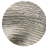
Super White Graphite Matte