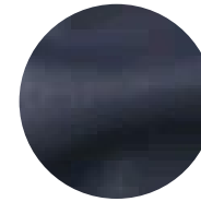
In The Navy