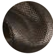
Black Anthracite Matte