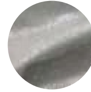
Stormy Hammered Silver