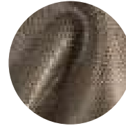
Stormy Copper Pearl