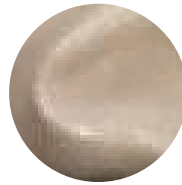
Cream Hammered Silver