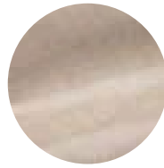
Cream - Special Order