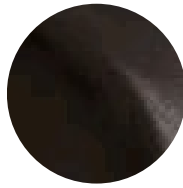
Espresso Black Pearl - Special Order