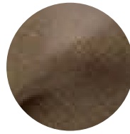
Sage - Special Order