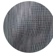
White Blue Metallic