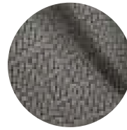
Satin Suede Smoke