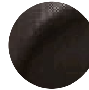
Espresso Black Pearl