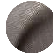
Smoke Hammered Silver