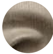
Cream Rose Gold