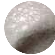
Cream Hammered Silver