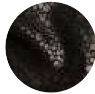
Black Anthracite Matte