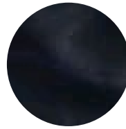
Black and Blue