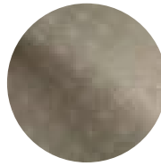
Cream Gold Matte