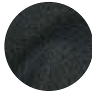
Black White Matte